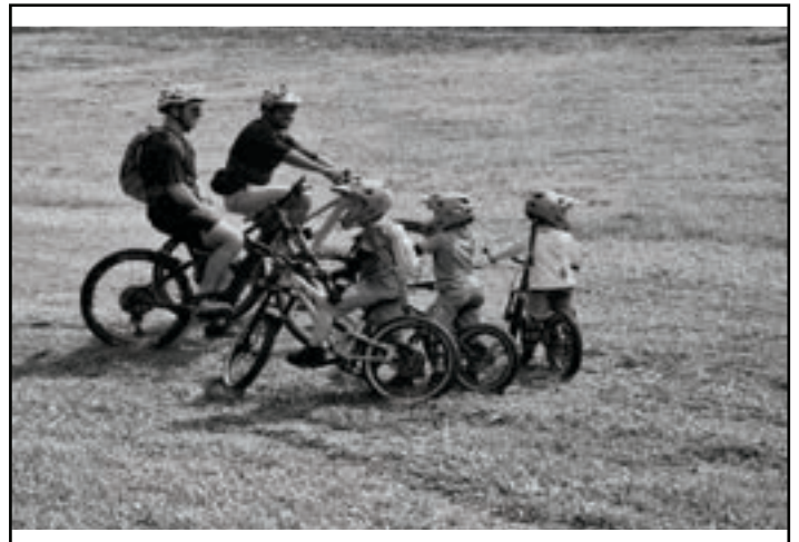
Some of the upcoming talent taking a few tips.

For those who haven't ridden the park yet, come have a ride as trails and park are in mint condition.