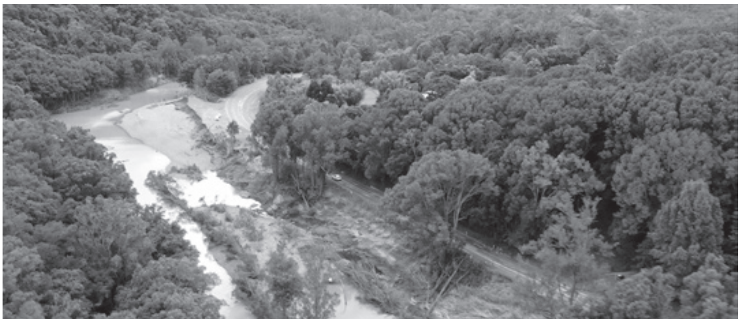
the Tweed River after the 2022 floods.