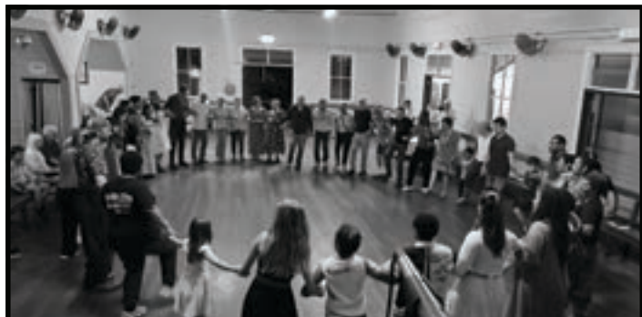
Traditional dancing from PNG, Afghanistan, Iraq and Iran was enjoyed by all.

Eleven local volunteers drove 23 refugees from Varsity Lakes on October 18 to the eight host homes for lunch.