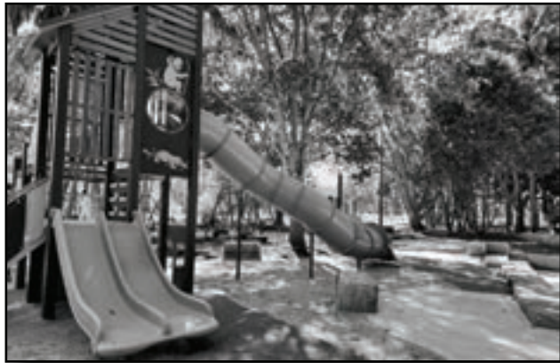
Above: a preview of some of the newly installed play equipment at Sweetnam Park.

Tweed Shire Council has made great progress in upgrading Uki's Sweetnam Park.