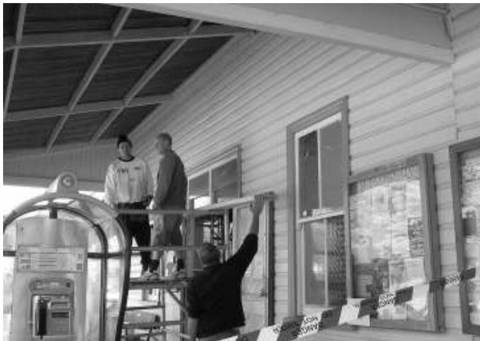
Hard at work on the essential repairs to the Hall.