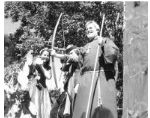
'Maid Marian', 'Robin Hood' and 'Friar Tuck' entertain the crowd. 'Friar Tuck' looks particularly convincing!