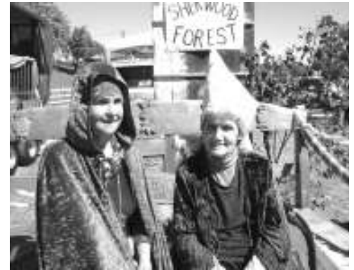
Two noble ladies added a bit of class to Uki's float at this year's Banana Festival Parade.