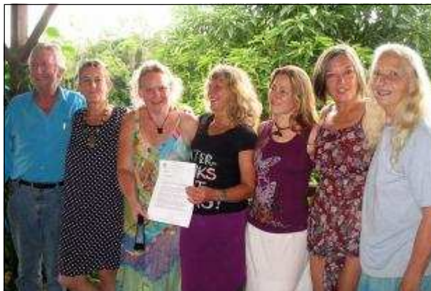
Save Byrrill Creek Campaigners at the website launch in Uki.

Please join us for a Bushwalk & Picnic at Byrrill Creek , Sunday 6 Feb, 10:30am, contact organiser Janaki on 6679 7163. We plan to walk along Cabbage Tree Creek. Bring food, water, swimmers, shoes etc. If it's wet, it will not be on. Meet at the Creek Flat, just past the lagoon, approx 5.6 kms along Byrrill Creek Rd.